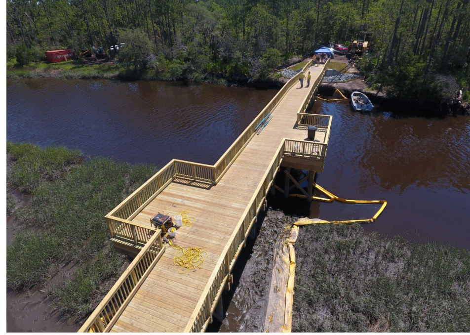
235' Trail Bridge over Pumpkin Hill Creek – Connect COJ & NPS